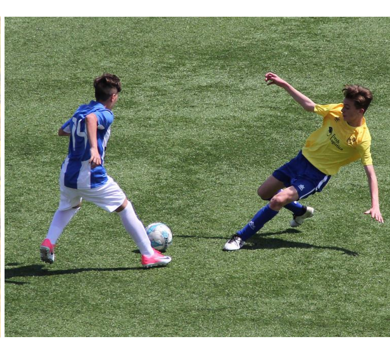
LEARN FROM THE BEST SOCCER CLUBS IN EUROPE